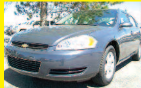
'08 IMPALA LT W/3.5L $14,870 Stk #P059617