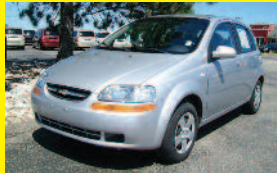
'08 CHEVROLET AVEO 5 $6,750 Stk #P019571C