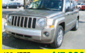
'08 JEEP PATRIOT LTD. $15,839 Stk #92504A