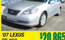
'07 LEXUS ES 350 $20,865 Stk #84235A