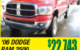
'06 DODGE RAM 2500 $22,743 Stk #P019676