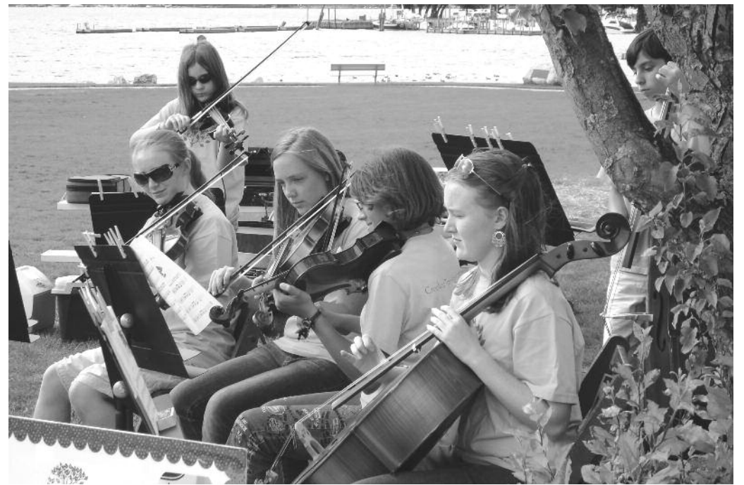
Summer Strings participants, Boyne City