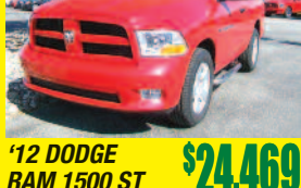
'12 DODGE RAM 1500 ST $24,469 Stk #80618A