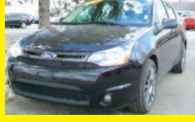
'11 FORD FOCUS SES $15,439 Stk #P029685