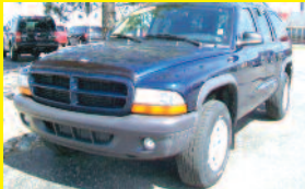
'03 DODGE DURANGO SXT $7,678 Stk #86302B