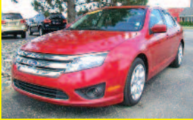
'10 FORD FUSION SE $14,500 Stk #P079643