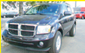
'08 DODGE DURANGO $14,500 Stk #90628A