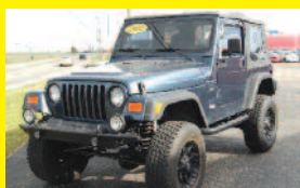
'02 WRANGLER SPORT $11,979 Stk #80604B