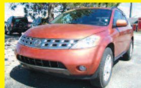
'03 NISSAN MURANO $12,887 Stk #86320A