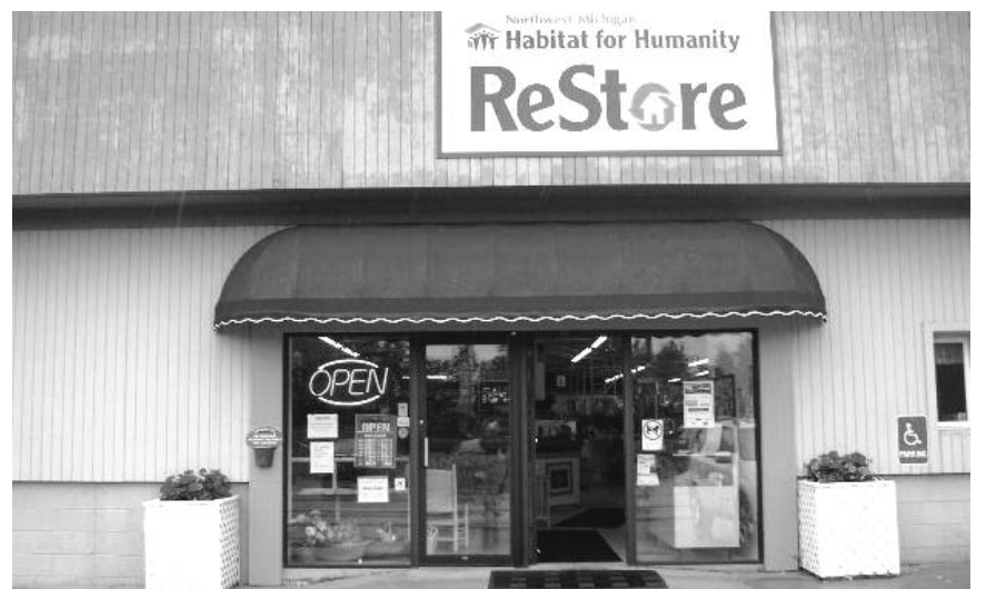
Customers shopping at the Habitat for Humanity Restore facility in Harbor Springs not only enjoy huge savings in price, they are helping to build the new home dreams of the families the Habitat organization helps each year.

The inventory also includes a constantly changing selection of gently used furniture and home accessories. About the only type of item they don't carry is clothing, and as with every Habitat for Humanity Restore in the state, they no longer accept box springs or mattresses.