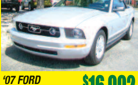
'07 FORD MUSTANG $16,992 Stk #76307A