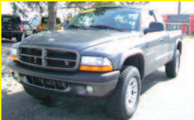
'02 DODGE DAKOTA SPORT $4,449 Stk #82203A