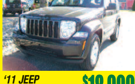
'11 JEEP LIBERTY SPORT $18,909 Stk #P029687