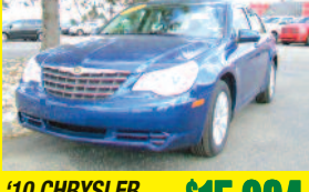
'10 CHRYSLER SEBRING LTD. $15,934 Stk #P039692