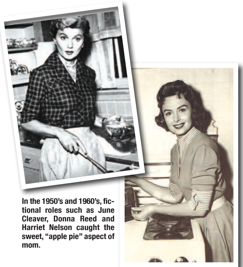
In the 1950's and 1960's, fictional roles such as June Cleaver, Donna Reed and Harriet Nelson caught the sweet, "apple pie" aspect of mom.