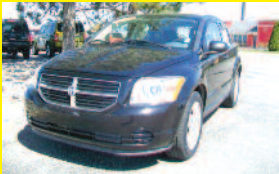
'07 DODGE CALIBER SXT $9,935 Stk #76303A