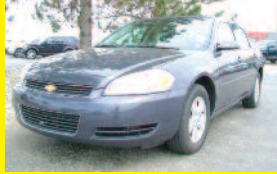
'08 IMPALA LT W/3.5L $14,640 Stk #P059621