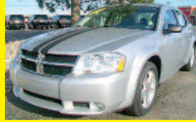
'08 DODGE AVENGER SXT $12,900 Stk #P079648