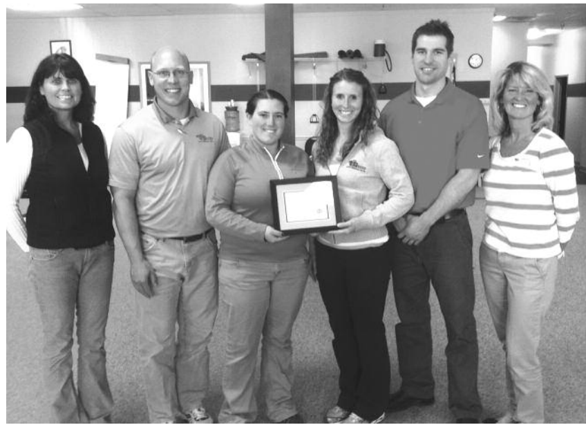
The Charlevoix Chamber of Commerce has selected the team at Northern Michigan Sports Medicine Center of Charlevoix as the May Business of the Month.