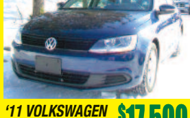
'11 VOLKSWAGEN JETTA 2.5L $17,500 Stk #P029686