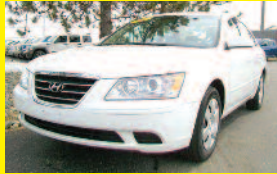
'10 HYUNDAI SONATA GLS $13,121 Stk #P049604