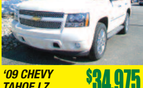
'09 CHEVY TAHOE LZ $34,975 Stk #80605A