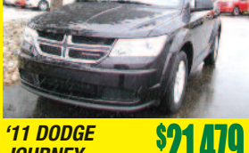
'11 DODGE JOURNEY $21,479 Stk #81500A