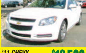
'11 CHEVY MALIBU 1LT $16,500 Stk #P029689