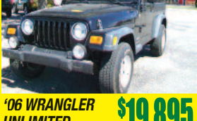
'06 WRANGLER UNLIMITED $19,895 Stk #P049698