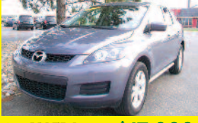
'07 MAZDA CX-7 SPORT $15,000 Stk #76206A