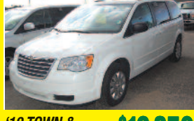
'10 TOWN & COUNTRY LX $16,350 Stk #P119674